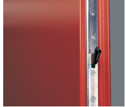
Security door S 43 has a multi point lock where the main lock is supplemented by hooks above and below.