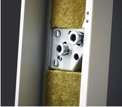
Frame screws facilitate fast and secure installation.