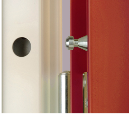
Hardened dog bolt pins to hinge edge and hinges with tamper proof pins increase security.