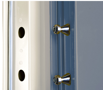
Hardened dog bolt pins to hinge edge and hinges with tamper proof pins increase security.