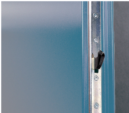
Security door S 44 has a multi point lock where the main lock is supplemented by hooks above and below.