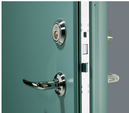
Multi point lock with hooks in upper and lower edges.