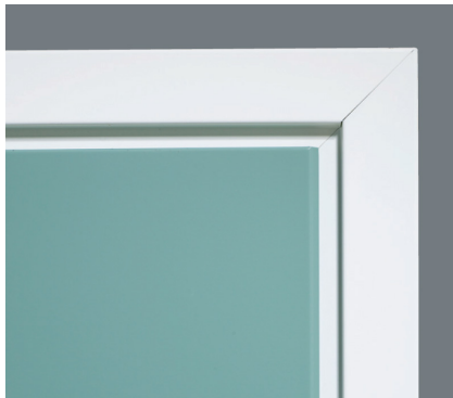
Diagonal edge seam gives a contemporary and sophisticated appearance.