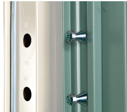
Hardened dog bolt pins to hinge edge and hinges with tamper proof pins increase security.