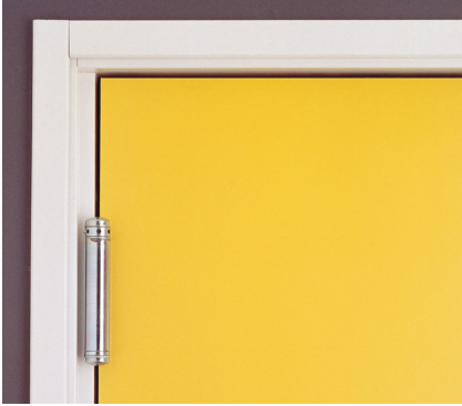
Protective edging around the whole door leaf that both protects and makes it easier to keep clean.