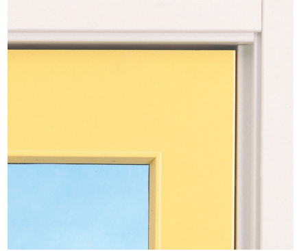
Swing door T15 can be supplied with vision panel.