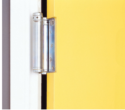
The spring tension on all hinges must be adjusted after installation.