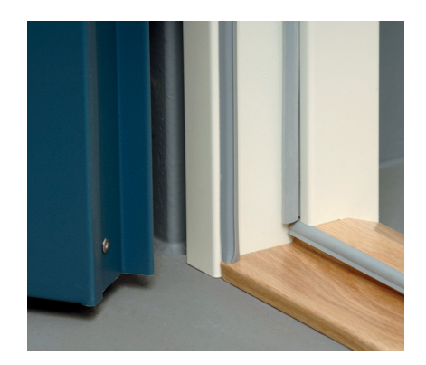
Double seals for high noise reduction and sealing and hardwood threshold with two coats of paint as standard.