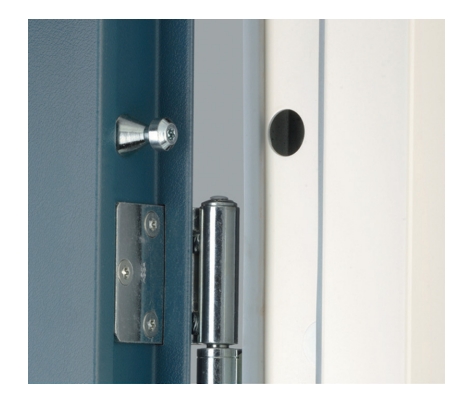
Dog bolts in the rear edge and hinges with secured pins increase security.