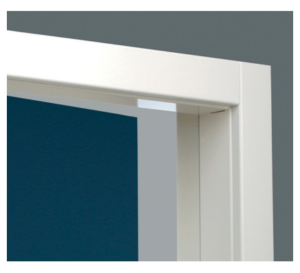
The ready insulated frame is supplied with dimensionally stable MDF architraves for internal cladding.