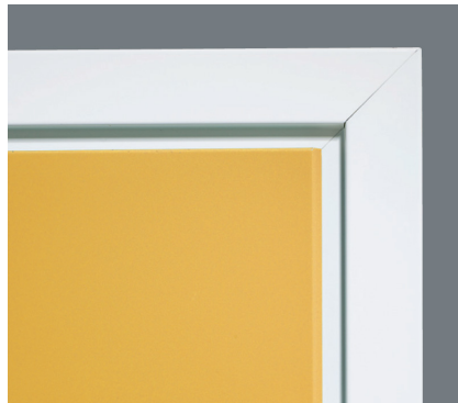
Diagonal edge seam gives a contemporary and sophisticated appearance