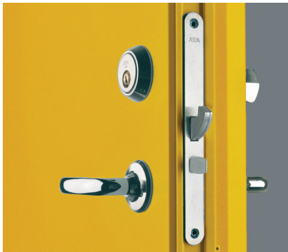
Lock case Assa 510.