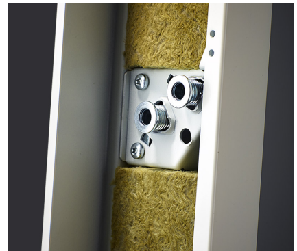
Frame screws facilitate fast and secure installation.