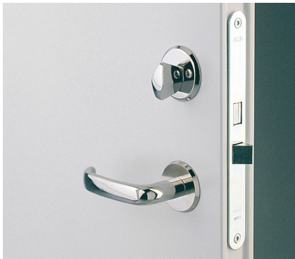
Lock case Assa 565.