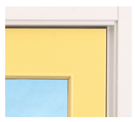
Swing door T15 can be supplied with vision panel.

The spring tension on all hinges must be adjusted after installation.