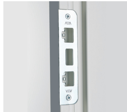
Striking plate for Assa 310 lock case.