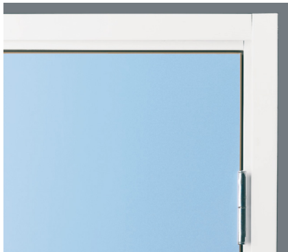
Protective edging around the whole door leaf that both protects and makes it easier to keep clean.